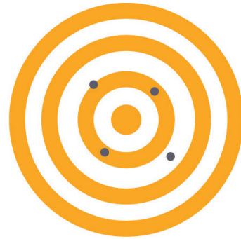
Accurate Not Precise

However, if your tolerance range is fairly wide, it may be okay. The shots aren't as close to each other as in the target on the left, but if the acceptable range of precision is the distance of \pm 2.5 rings, then you're within spec.