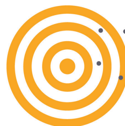
Not Accurate Not Precise

In broad engineering terms, “precision” generally measures repeatability. When comparing 3D printing materials, “precise” can refer to materials capable of printing highly intricate geometries. For example, Formlabs Grey Pro Resin and Rigid Resin have high green modulus, or stiffness, which enables successful printing of thin, intricate features.