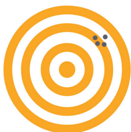
Not Accurate Precise